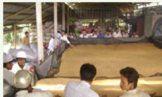
Demonstration of an 8 ton-reversible air-flow flat bed dryer in Giong Rieng district, Kien Giang province during a training session.

The research was funded under the Collaboration for Agriculture & Rural Development (CARD) program (AusAid funded).